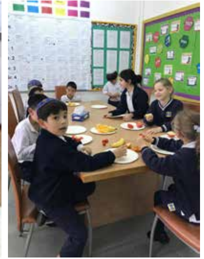
We welcome the Hebrew month of Shvat, during which we celebrate the new year of the trees. During our JS lessons we reviewed the parts of the tree and looked for different kinds of seeds in the fruits. We look forward to celebrating Tu B'Shvat on Monday, 21 Jan.