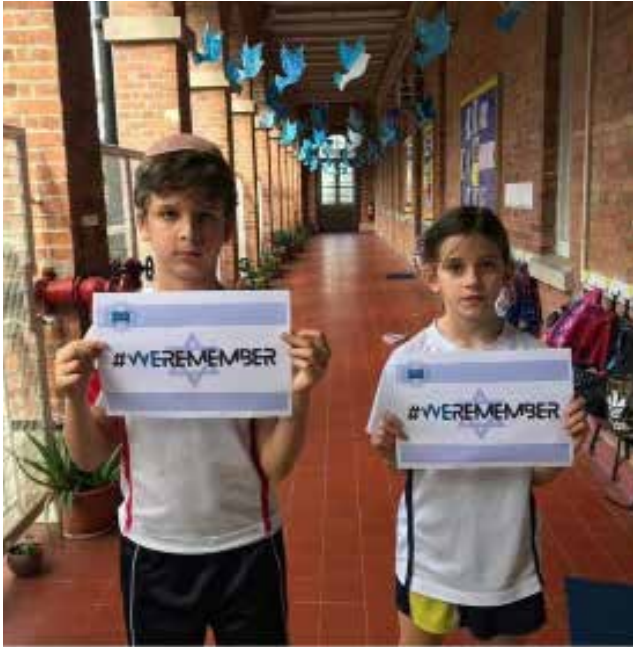
The first #WeRemember photos are coming in! These students from Carmel Elementary School in Hong Kong know the importance of remembering the Holocaust. Do you? You too can join the campaign - find out more: WeRemember.WJC.org